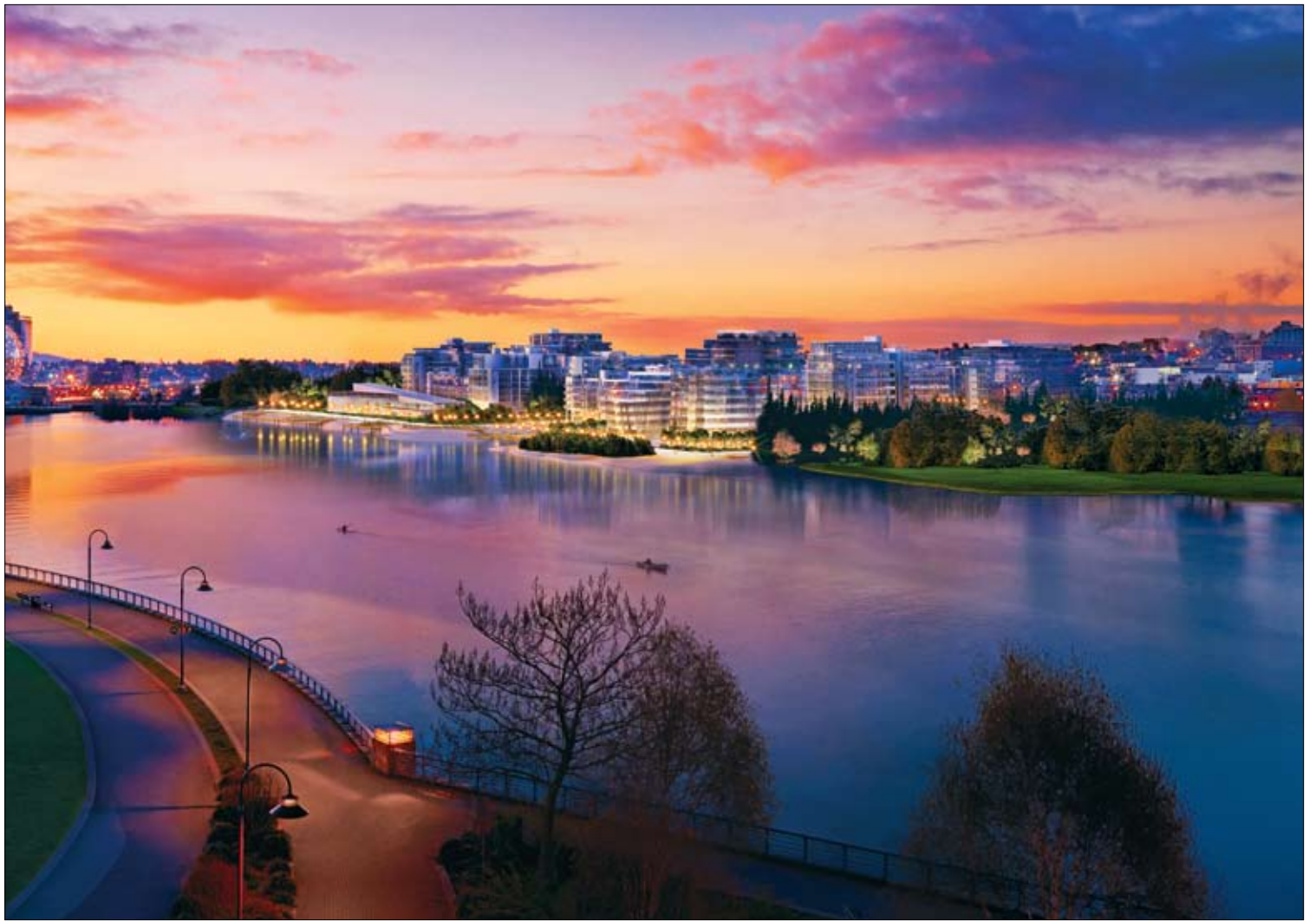
A rendering of Millennium Water shows its prime location on Vancouver's waterfront at southeast False Creek. The community will house Olympic athletes during the 2010 Winter Games, then homebuyers will move into the stylish residences afterward.

The sustainable community will offer an urban centre for residential, commercial and public use that will feature plenty of parks, a town square, a farmers' market, a 30,000-square-foot