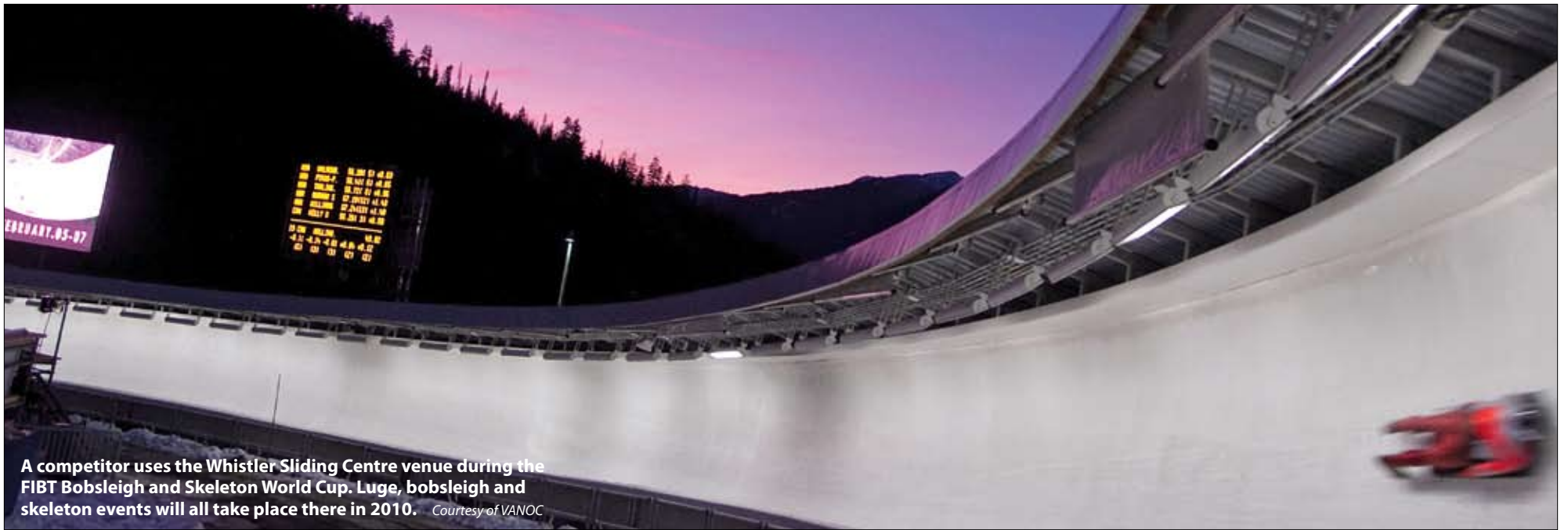
A competitor uses the Whistler Sliding Centre venue during the FIBT Bobsleigh and Skeleton World Cup. Luge, bobsleigh and skeleton events will all take place there in 2010.