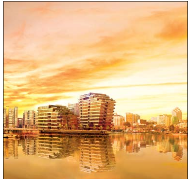
A bridge will span False Creek and connect to a seawall on the southeast side, where Millennium Water is being constructed (top photo), while a rendering depicts a view of the development from the other side of the creek (above). Homes at Millennium Water will feature chic, European-inspired design, noticeable in the kitchens (left). The master-planned community is sustainable as well, and will use conservation strategies to be energy-efficient, such as green roofs and recycling rain water.